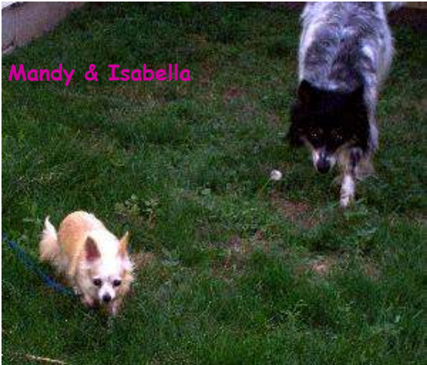
Mandy & Isabella

Mandy is perking up and today she spent some time in the yard exploring (until now she has just sat on my lap quivering). She was pretty hesitant at first. She walked all over sniffing. After a little while, she suddenly realized that she was free!!!! She put her head up and then took off in doggie circles just enjoying her run. It was a wonderful sight to see her truly enjoying herself. Of course when it was time to go in she was terrified of me picking her up. It took quite awhile to catch her, but it was so worth it! Her gait is a bit unsteady and awkward. I think a daily run in the yard will fix that in no time. Isabella is in the pictures because she was never far from Mandy's side. Protecting her little charge!